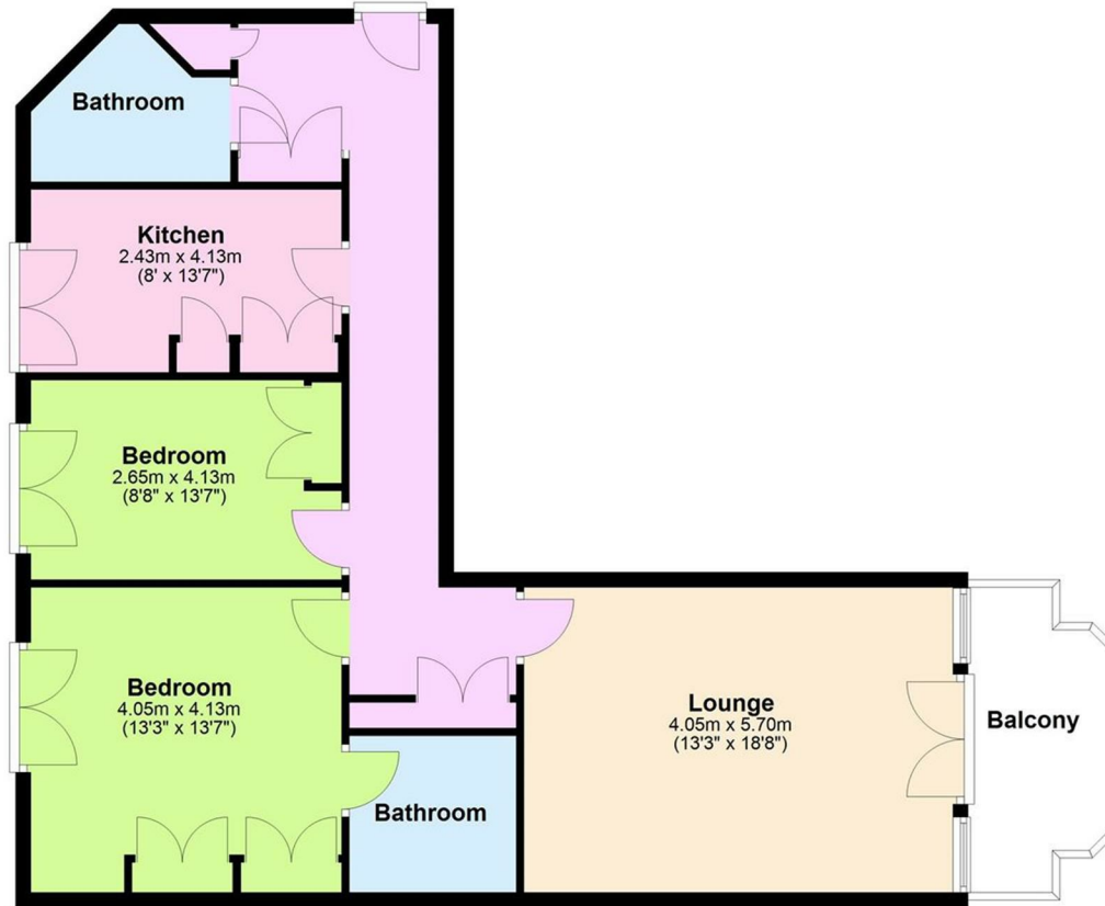
Total area: approx. 89.4 sq. metres (962.8 sq. feet)